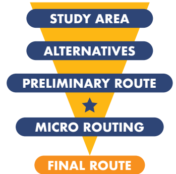
Waasigan Transmission Line Project | Location of Impacted Communities and Preliminary Preferred Route

The actual cleared "right of way" for the transmission line is expected to be up to 46 m (150 ft) wide . The right of way will include towers and supporting wires to stabilize the structures.